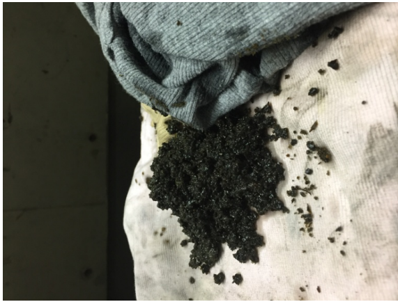
Decomposition of muffler disintegration from oil that is found migrating into the operating valve.

in the mufflers, and the O rings in main control valves. This exposure causes synthetic and rubber seals in the system to lose their flexibility and become brittle. It also creates rust on metal components in the system. Worse yet, the sludges produced as a by-product of overheating acts as insulation, thereby reducing the heat dissipation of the reservoir holding tank. The contamination also causes micro pitting of milled and polished metal surfaces by corrosion of the pump and valve components. This results in a reduction of the lubricating properties of the oil when degradation is not detected and properly managed.