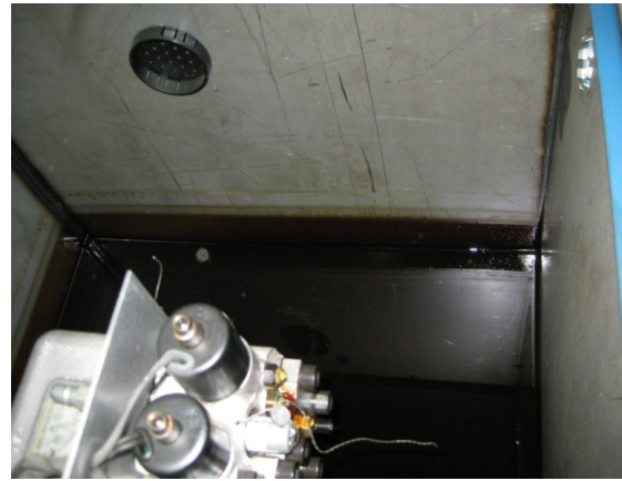
Sludge/varnish deposited on inside of tank and also found in the operating valve