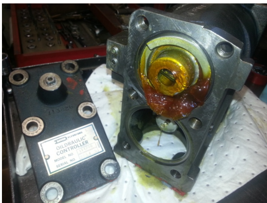
Vegetable oil residue (sludge)